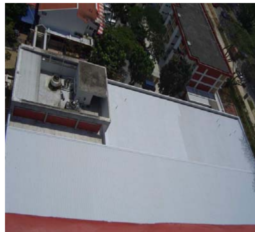
Fig: 2. Coating on a concrete terrace & pipe surface Fig: 3. Coating on a masonry wall