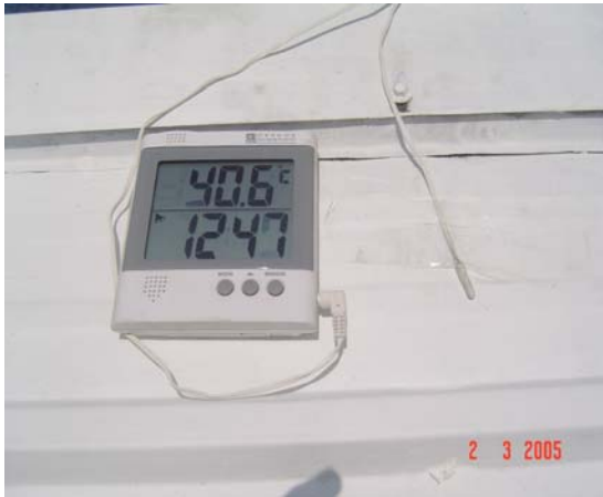
Figure5. Monitoring of temperature on a coated metal surface