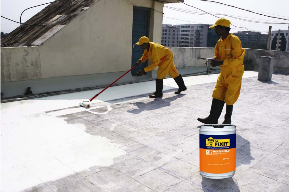
Figure8. Application of heatshield on a concrete surface