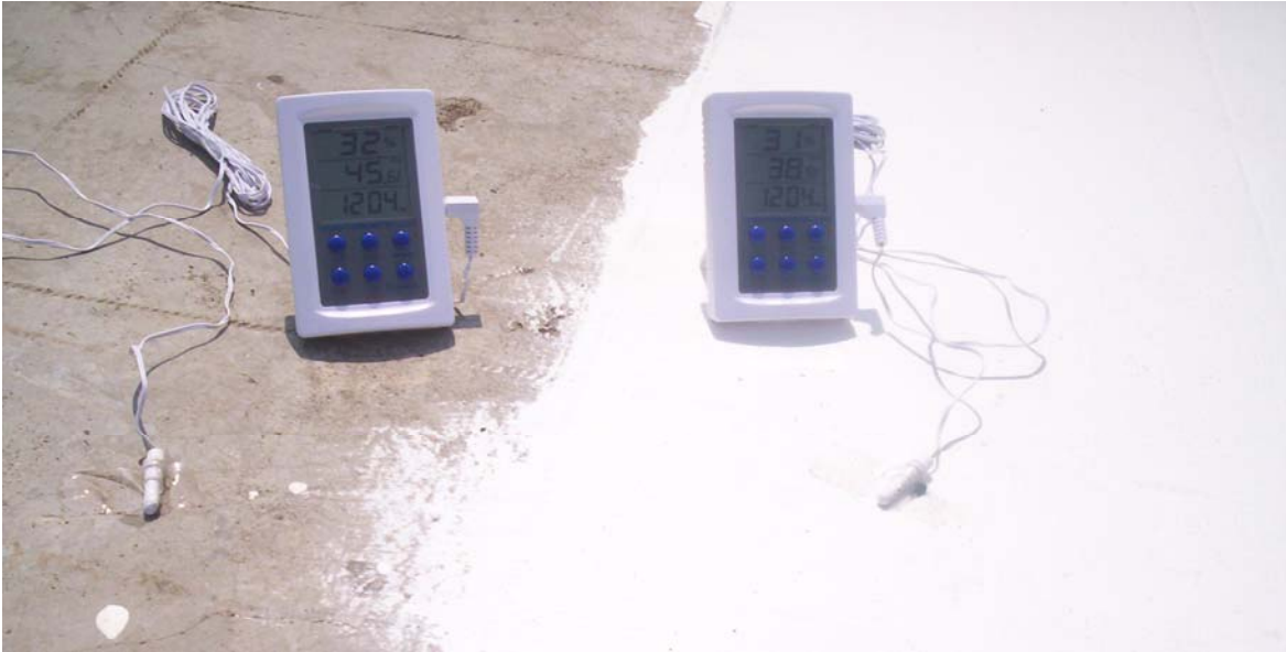
Figure 7. Monitoring of temperature on a coated and uncoated concrete surface