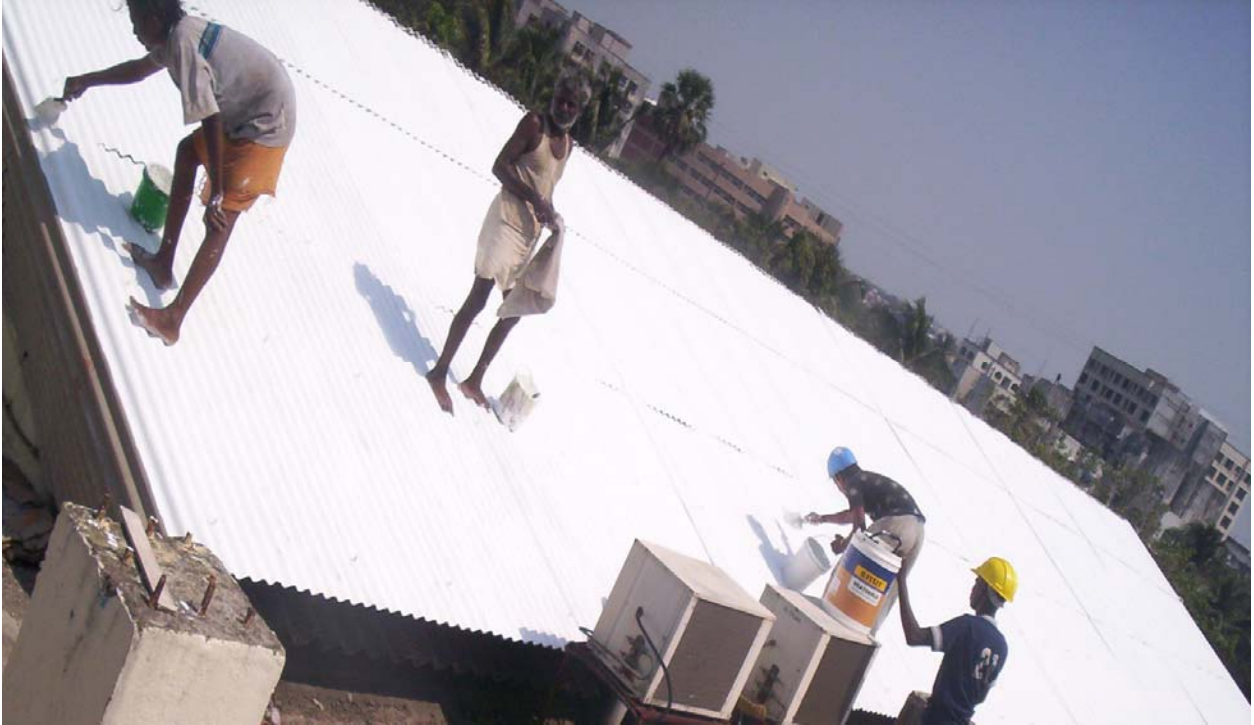
Figure9. Application of heatshield on a metal surface