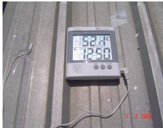
Figure 6. Monitoring of temperature on an uncoated metal surface