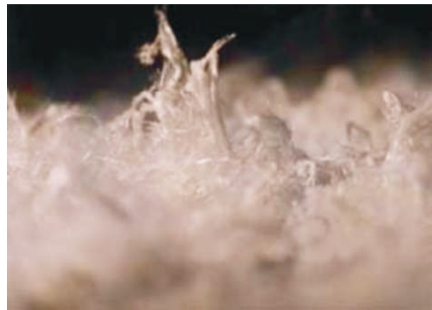
Figure 2. Growth of crystals