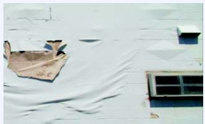
Fig 2 . Effect of Coating unbreathable to accommodate vapor drive

There is much to consider when selecting coatings for above-grade concrete and masonry. While we have addressed some of the challenging issues here, it is important to remember that comparing products is an inexact science. The process starts with the development of a standard. A scientist in an R&D lab performs the test based on the standard. The scientist provides results to a marketing person who incorporates the information into a technical data guide. A salesperson takes the guide and gives it to an engineer or architect who uses it to compare products. Anywhere along that process, misinterpretation is possible. So what is the answer? Continue to ask questions, provide factual information, and get involved with organizations like ICRI so the dialogue does not stop and the industry continues to improve.