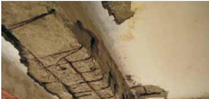
Fig. 1: Corrosion of rebar

A systematic visual inspection was conducted to get a fair idea about the deterioration and distress of the existing RCC buildings. Visual inspection and extensive photography of the building were taken to decide the extent of investigation and selection of tests. It was observed that columns and stair case beam of the building were cracked. Water soaking marks were present. Plaster and some concretes were worn-out from the column and stair case beam. Reinforcement bars were exposed. Fig. 1 shows the visual inspection showing rebar corrosion and spalling of concrete.