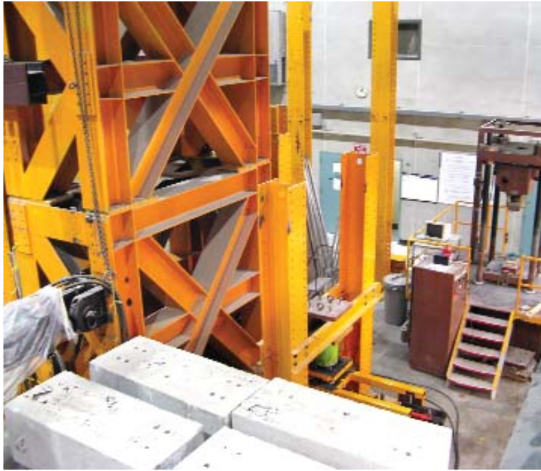
Maximum safety precautions need to be taken while applying polymer concrete.